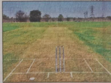
FOR BIG TOURNAMENTS

The turf wicket was established at the college at Panjapur in Trichy city by a profes-